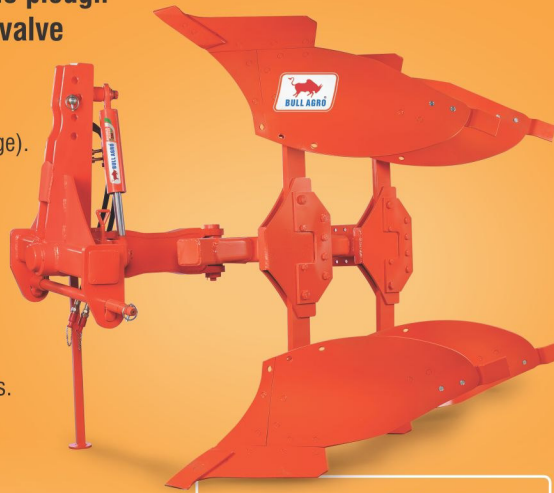
ADJUSTABLE PLOUGH - BPP 250