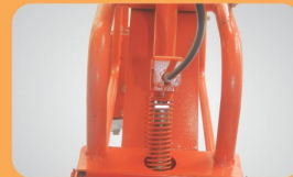
HEIGHT ADJUSTMENT FACILITY