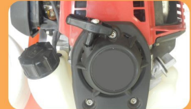
BEST PETROL ENGINE